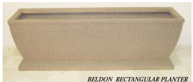
BELDON RECTANGULAR PLANTER