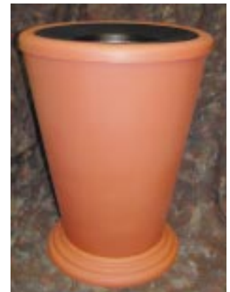
PRESCOTT TRASH RECEPTACLE