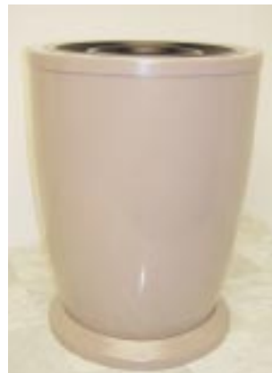
DUNHILL TRASH RECEPTACLE