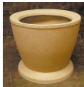
BELDON CIRCULAR PLANTER