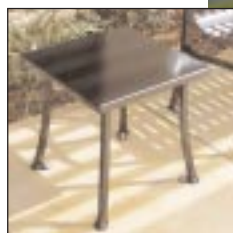
MIRAGE, END TABLE MODEL MRET

*NOTE: THE SOLID SURFACE ACRYLIC TABLE TOP IS A NON-POROUS, HYGIENIC COMPRESSION MOLDED SEAMLESS TABLE TOP IDEAL FOR EITHER INDOOR OR OUTDOOR USE. THIS TABLE TOP IS CHEMICALLY ENGINEERED TO RESIST WEATHERING, FADING AND DISCOLORATION CAUSED BY SUNLIGHT, MOISTURE, HEAT, COLD, LIQUIDS AND FOODS, AND CARRIES A 5-YEAR LIMITED WARRANTY.