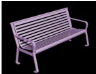
CCBB-HLF: Horizontal Laser Cut Flat Bar Seat