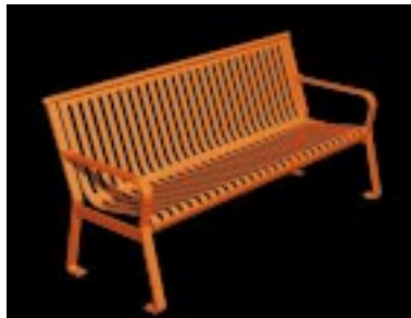
CCBB-VLF: Vertical Laser Cut Flat Bar Seat