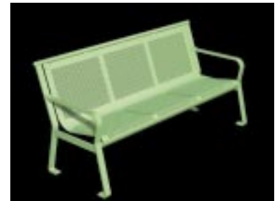
CCBB-PS: Perforated Steel Seat