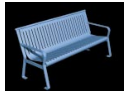
CCBB-LS: Laser Cut Seat