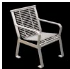
CCBB-RB-2: Round Bar Steel Seat, Doubles as a chair