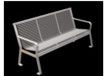
CCBB-RB: Round Bar Seat