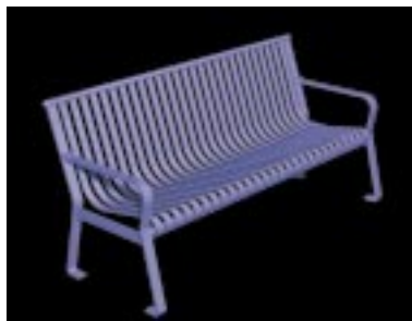
CCBB-FB: Flat Bar Seat