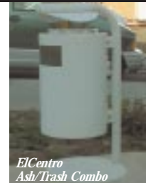
El Centro Ash/Trash Combo