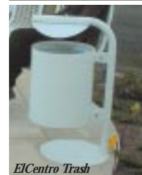
El Centro Trash